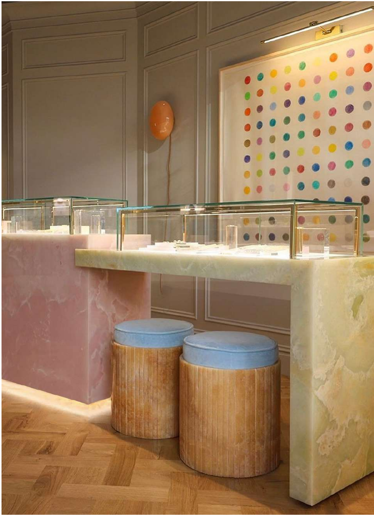
CUSTOM MADE PROJECT FOR LOQUET LONDON JEWELRY STORE

AT MARBERA, WE OFFER A SERVICE WHERE WE PROVIDE EXCEPTIONAL STONES AND CUSTOM DESIGNS. EACH DESIGN DETAIL IS METICULOUSLY STUDIED TO ENSURE THE FINAL PRODUCT IS NOT ONLY BEAUTIFUL BUT ALSO HIGHLY PRACTICAL.