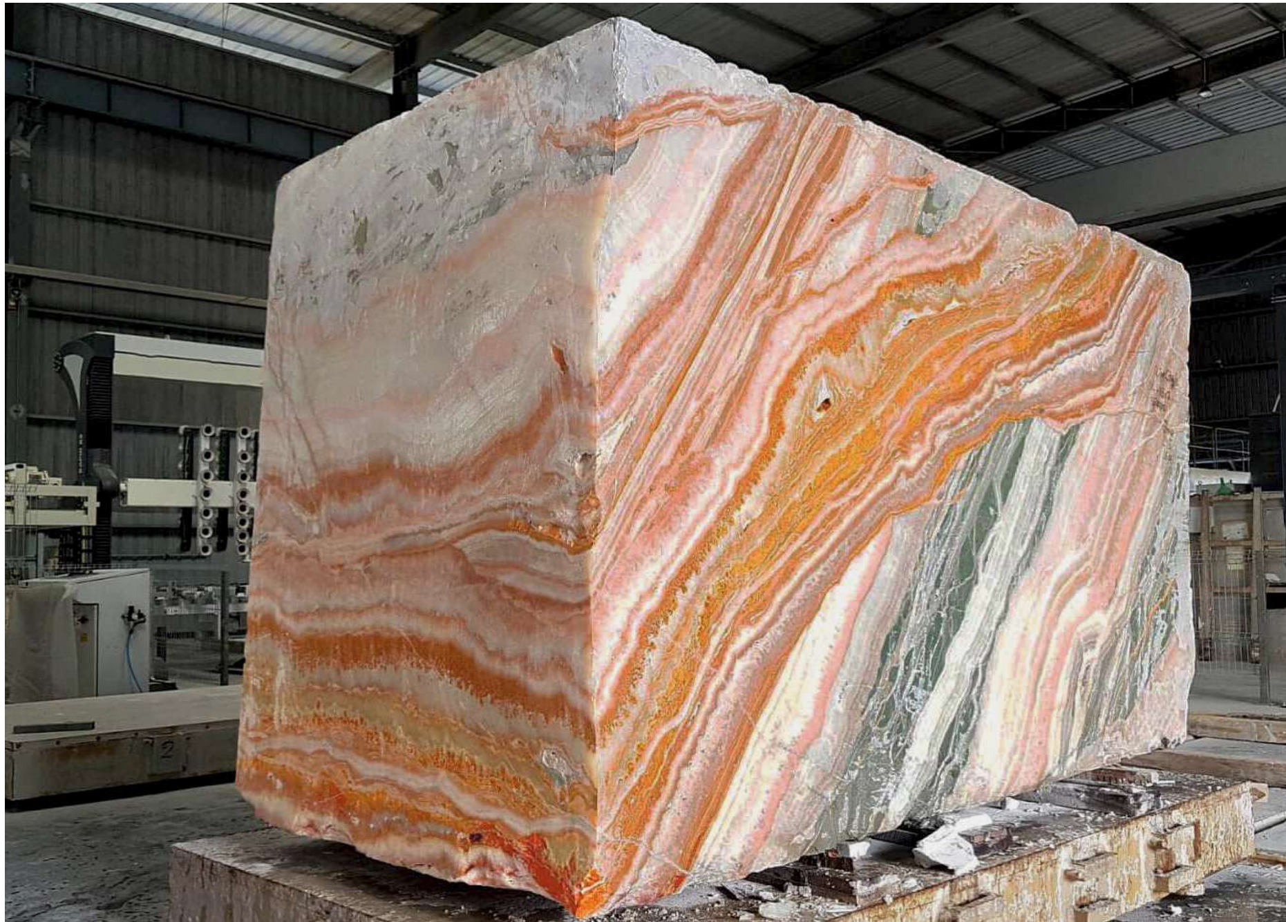
MARBERA SOURCES THE FINEST, MOST ORIGINAL, AND RAREST BLOCKS OF RAW MARBLE FROM AROUND THE WORLD TO CREATE EACH PIECE FROM A SINGLE ROCK OR SLAB.