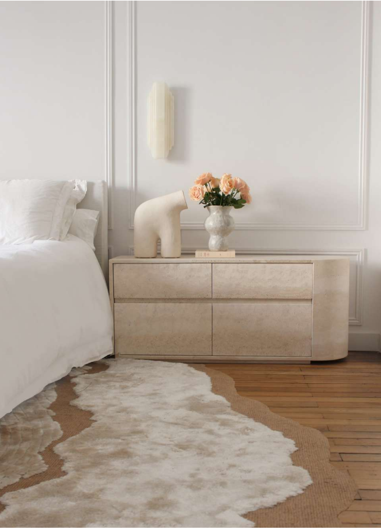
CUSTOM MADE TRAVERTINE BEDSIDE TABLES