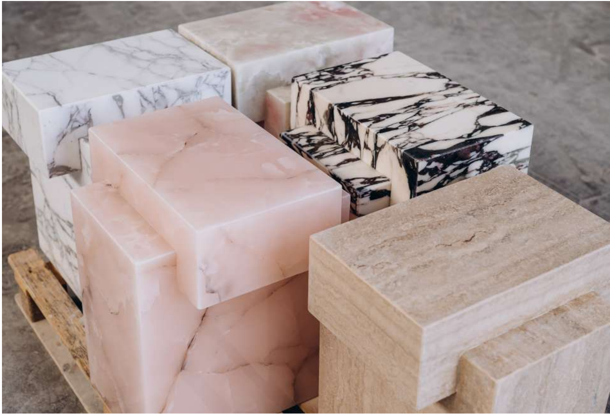
GAIA TABLES IN MARBERA'S WORKSHOP