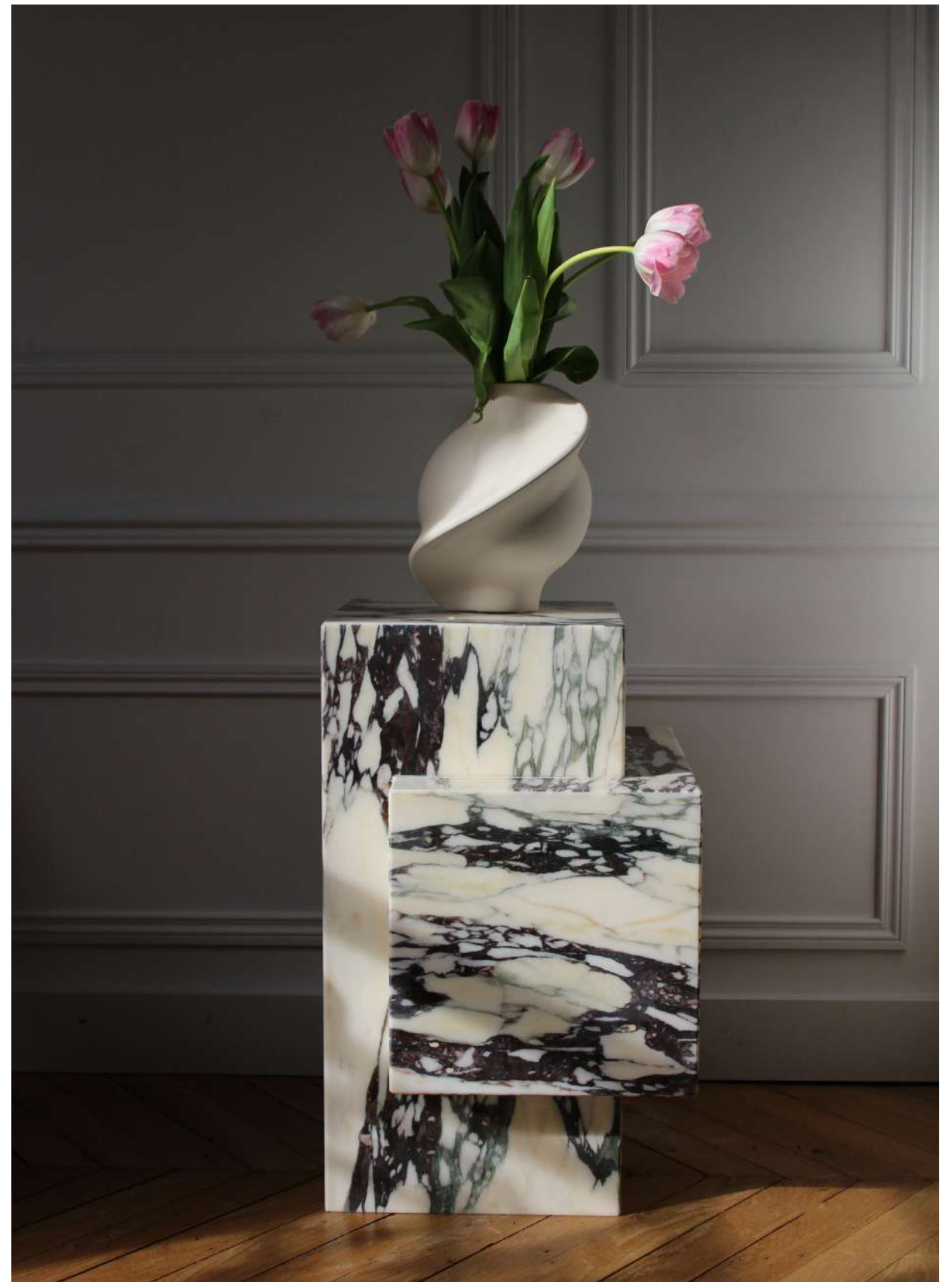
ELLA CALACATTA VIOLA TABLE