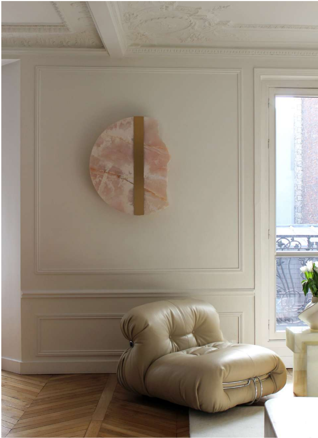
MARBERA SHOWROOM IN PARIS