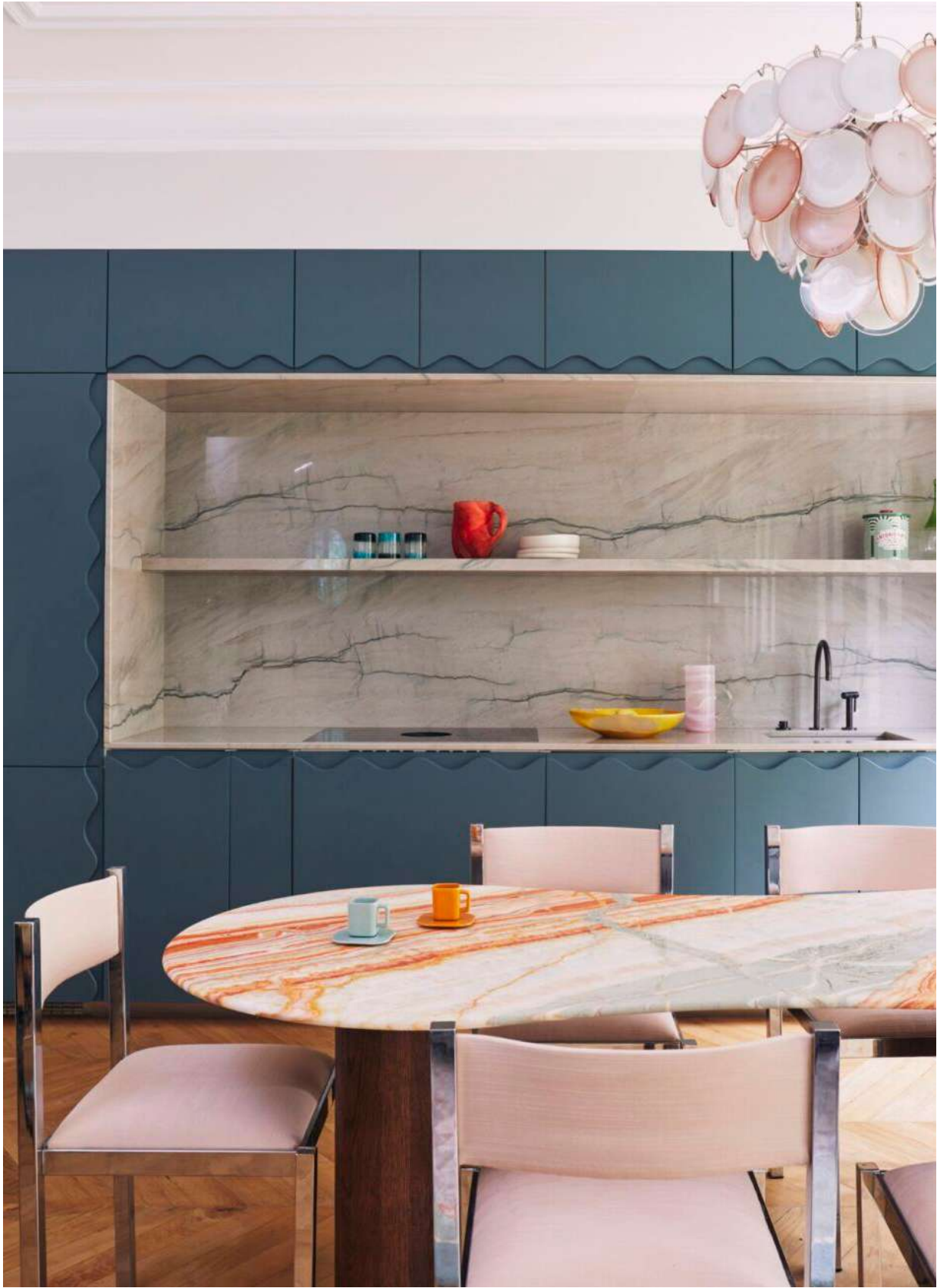
CUSTOM MADE BY MARBERA WAVY RAINBOW ONYX DINING TABLE