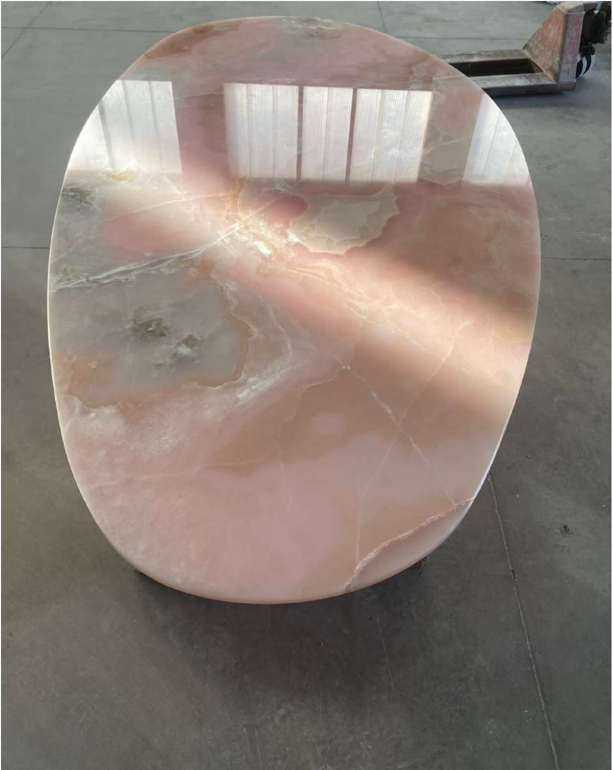
JORDAN PINK ONYX DINING TABLE