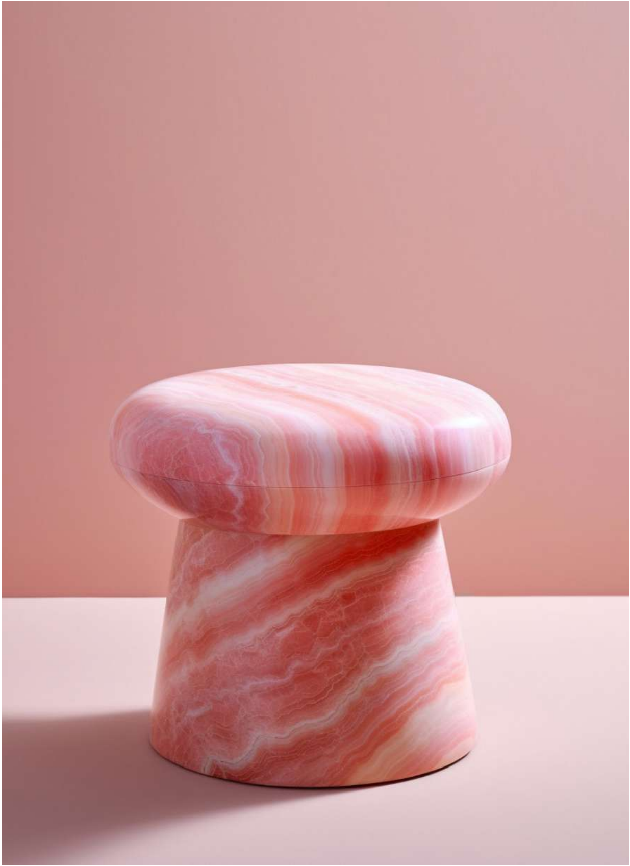
BOBI PINK ONYX STOOL