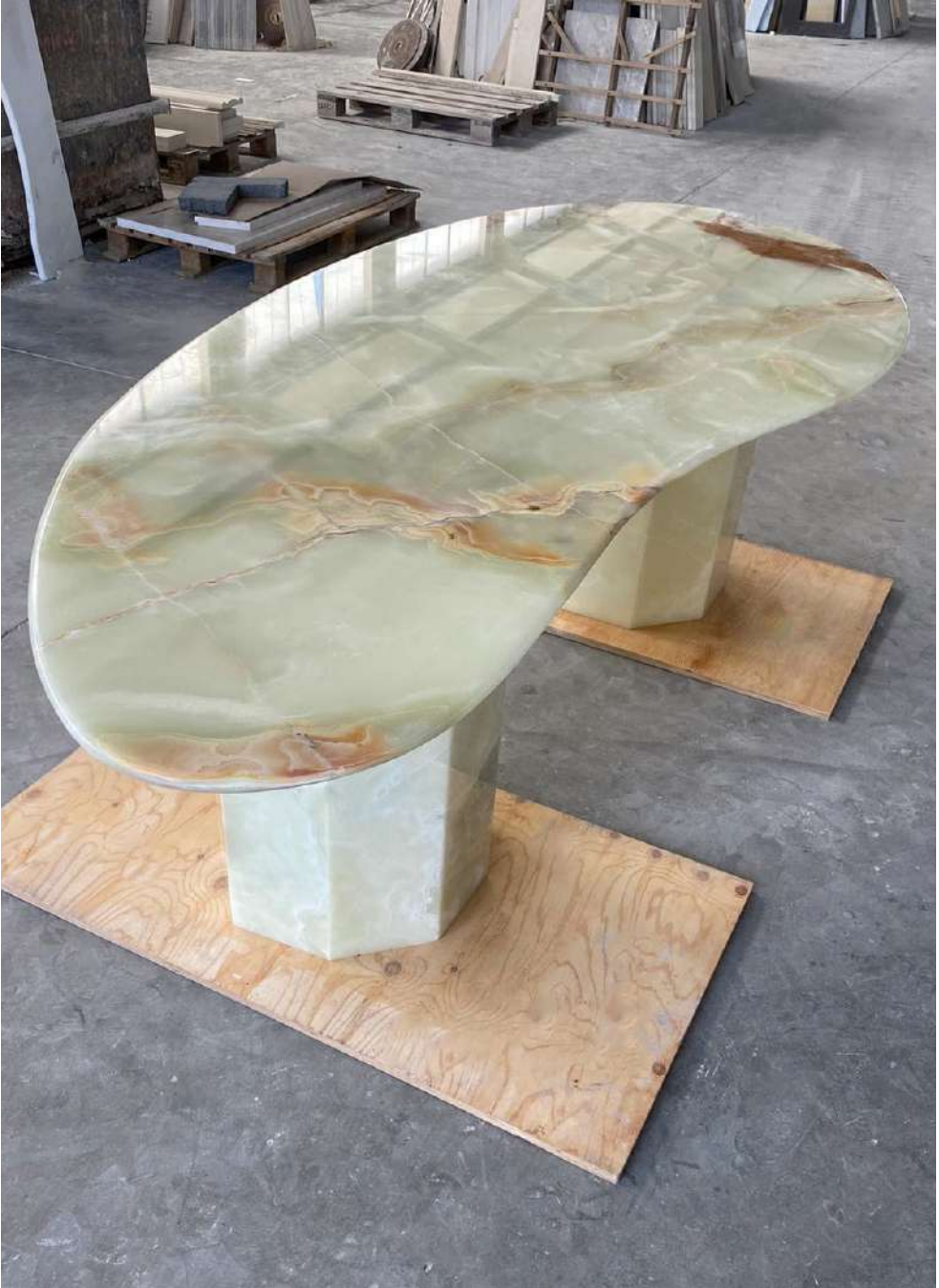
GREEN ONYX DINING TABLE