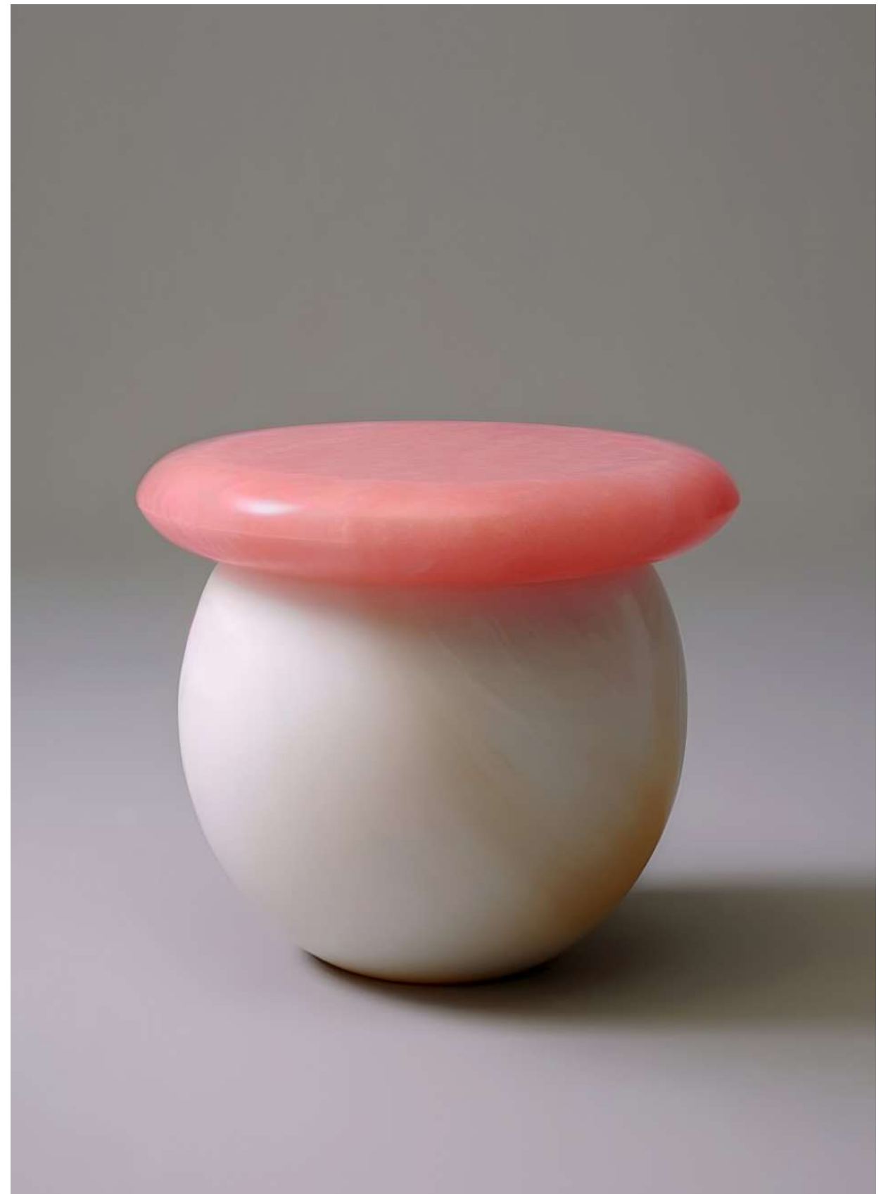
"LE CHOU À LA CRÈME" SIDE TABLE